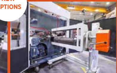
Continuous spirals knives cutting heads