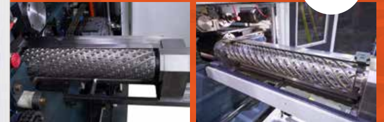
Continuous spirals knives cutting heads